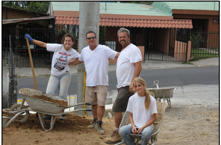
Work begins on the front gate at the Children's Home