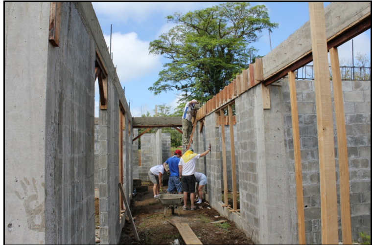
The walls are up on the clinic!

Several mission teams have helped us at the medical clinic this year. The walls of the building are up, the plumbing is being put in this week and the concrete floor will be poured by several teams over the coming weeks. We are praying that the clinic construction will be completed in the coming months and then we will begin the programming and furnishings stage of this outreach ministry to the people in the Sarapiquí region.