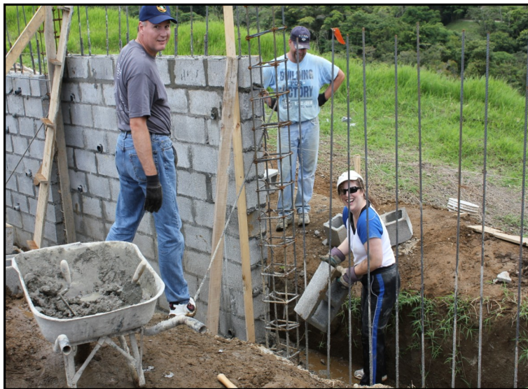
Work continues on the retaining wall for house #2

The younger children, the three year-old boy and four year-old girl, immediately began playing with the toys. And, the 12 year-old sister, asked if it would be okay for her to try on her new clothes. Besides the children, three government employees accompanied the children to the Children's Home. It was their first time to see the project and so we gave them a quick tour of the grounds and shared the overall plan for five homes with them. We then went back into the house and sat down at one of the dining room tables. They shared the history of the children with us, their school records, the medical records, etc., then I had to sign an acceptance form of responsibility that I was receiving the children. My signature was so shaky, I couldn't even read it. I had not prepared myself for this step. But, as I scribbled across the paper, I felt an overwhelming presence of the Lord, a calmness that can only come from Him. And, I knew that He, and only He, had gotten us this far and that He would see all of us through all that lies ahead.