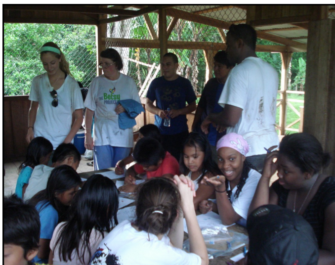
Bible School with the children on the Reservation

Camp. On July 2, four of the most excited young people you will ever meet boarded a plane for Alabama. They attended camp from July 3 through July 8 before spending the last few days with families from Asbury Methodist Church. Today, they return to Costa Rica and we cannot wait to hear the stories they will tell. We are so grateful for the generosity of this one man, members of Asbury Methodist church, and the folks at Space Camp who were able to make this experience possible for these Costa Rican youth. Given the success of this year’s experience, our thoughts have already turned to wondering how we might be able to repeat or even expand such a trip in the coming year!